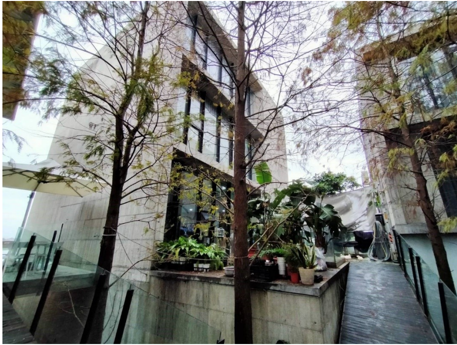
Yilan Branch auctioned a beautiful house located at Zhuangwei Township, Yilan County