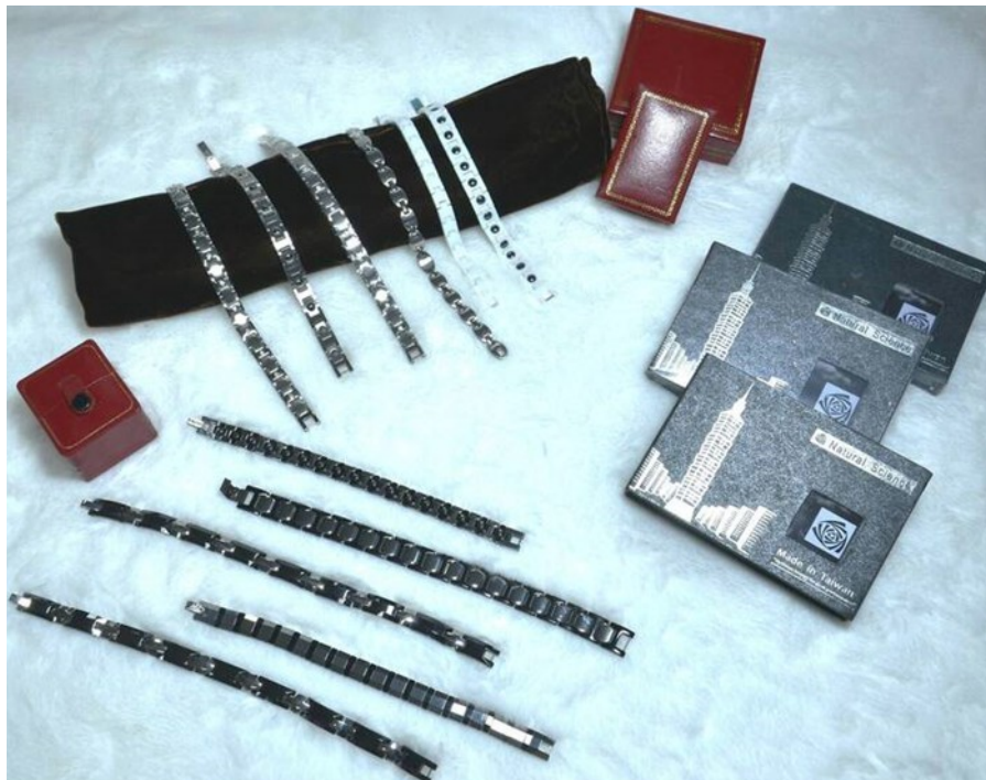
Taipei Branch auctioned germanium bracelets and many other goodies