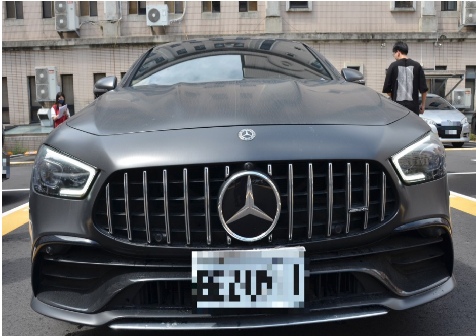
Taichung Branch was entrusted by the Taichung District Prosecutors' Office to auction off the Mercedes-Benz AMG GT53 at a high price