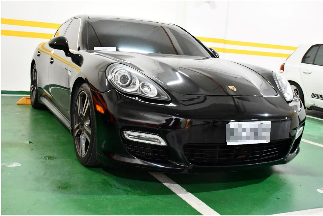
The Shilin Branch auctioned the black Porsche PANAMERA TURBO RV