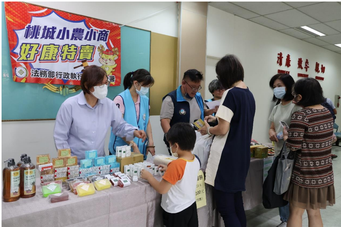
The Chiayi Branch held the “Grand Sales of Local Farmers and Merchants”